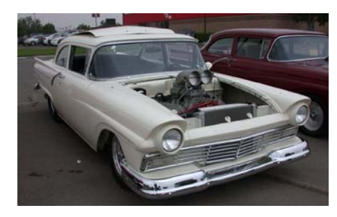
Gathering West 2004 Coverage Inside!!