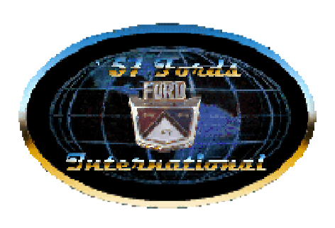
Dedicated Solely to the 1957 Ford Passenger Car