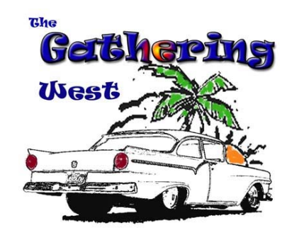
`57 Fords International October 16-17 California Speedway Fontana, CA FFW Pacific Nationals