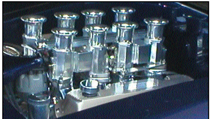
How's this for a nice induction system for a Ford small block? This was in an early 50's custom displayed at the Ford Racing Trailer. I wonder what the cost and gas mileage are?