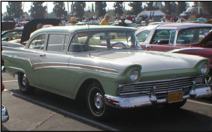
I thought I had obtained the names and phone numbers of all the 57's shown at Knotts this year. But, obviously I didn't, this is another clean "original" custom 300. Sorry!!!