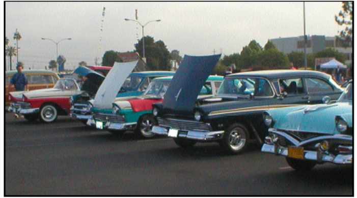
This shot was taken early, before many cars had arrived. Unfortunately, it was first come, first parked and they did not park all the 57's together. The wagons were 5 rows away.