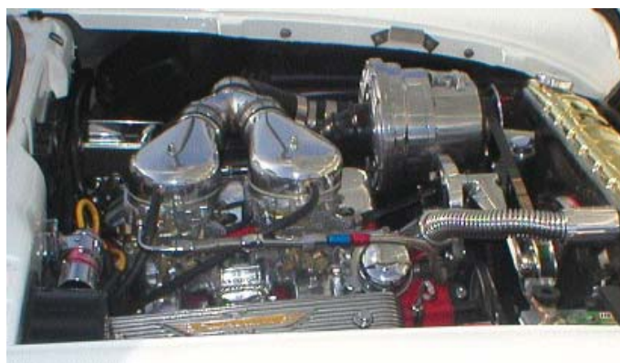
The Bentner's dual quad, supercharged 312 Y-block. How's that for finishing off a classy ride, not to mention very rare.