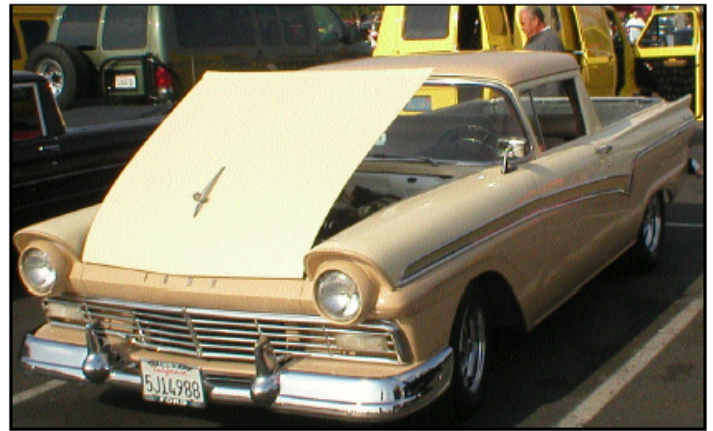
There was one lone 57 Ranchero present. I didn't get the name of this owner either, probably because the car was Chevy powered. Enough said???