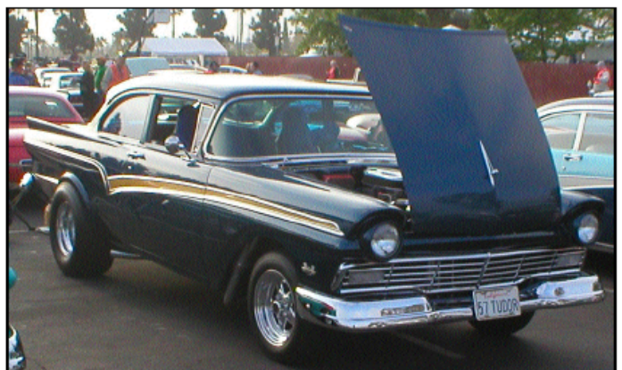
Richard Crawford's beautiful 57 Custom 300. A flawless deep blue pro-street '68 427 dual quad medium riser with classic fenderwell headers. There is a tremendous amount of attention to detail through out the car. Truely awesome.