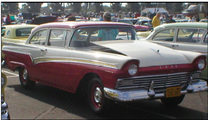
Here is another clean 57 Custom 300. From the looks of this car it is all original down to the license plate from the 50's. this is another owner I didn't get the name of. Sorry again!!!