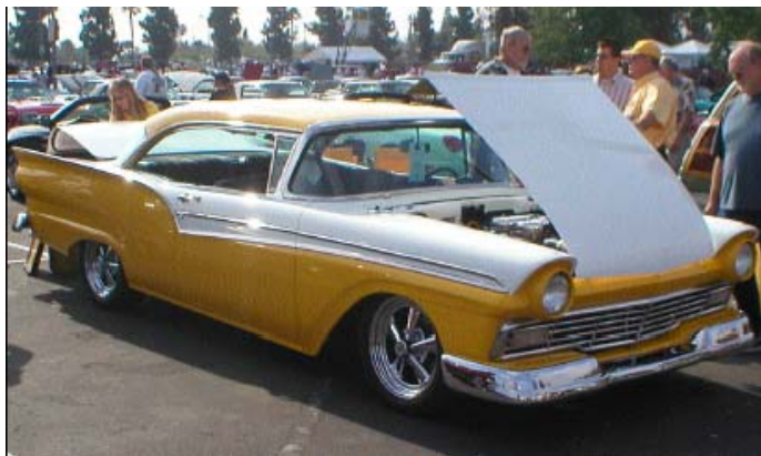
Bob & Bev Bentner's 57 Fairlane 500 featured in a Super Bowl Coke Commercial, the interior is yellow & black.