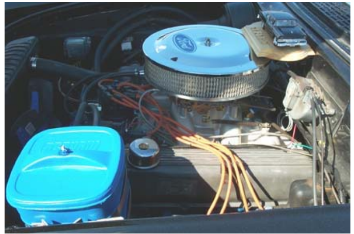
Stout 429 based mill provides motivation for this beauty.