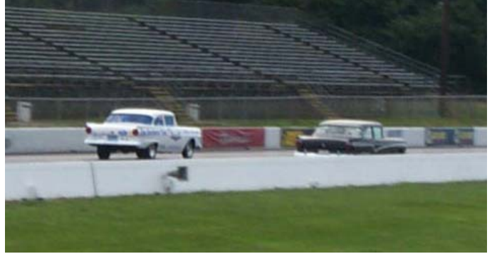
Larry and Joe Gerardi slug it out in the semi-final round of our Shootout last September.

Larry owns a beautiful example of '57 Ford, and enjoys showing it, as well as the occasional flog at the track. This '57 rides in style in an enclosed trailer to the various events, protecting it from the motoring public. But make no mistake, this '57 was built to drive and enjoy. It definitely is a fine '57.