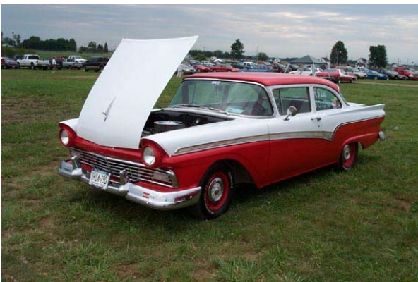
Marv Smith drove up from Virginia, raced in our shootout, won it, raced the top '57 of the Y-Block shootout, won that, showed both days, and drove back home with cash and a trophy. What a way to spend Labor Day Weekend !!